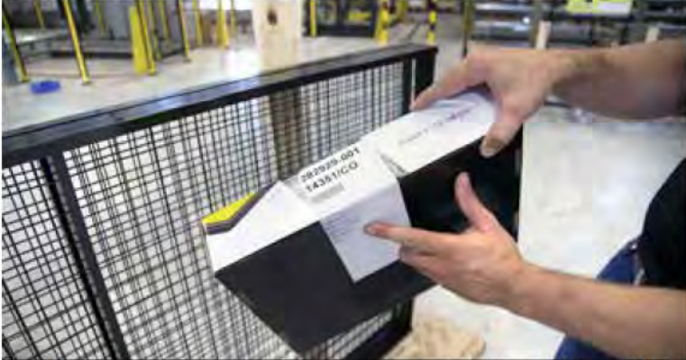
The boxes with small parts are marked with the order number, pack date, and signature from order pickers for traceability. They also have a list of contents to quickly get an overview of the content which is especially good when the orders have more boxes.