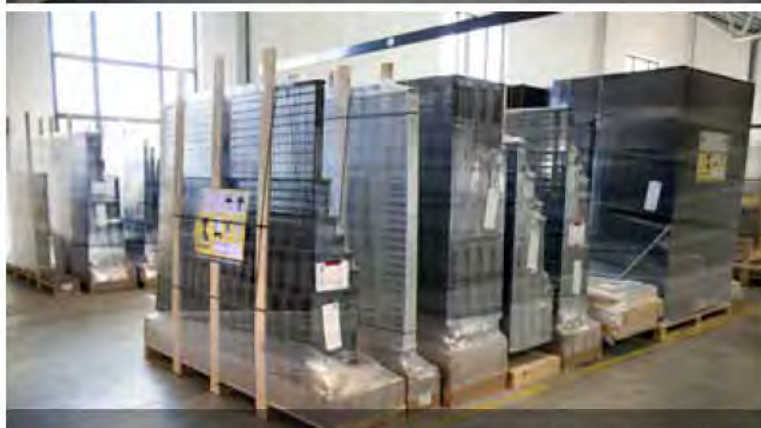
We have supplied the X-Pack 2.0 for almost 2 months and the transition from the old system has gone better than expected.