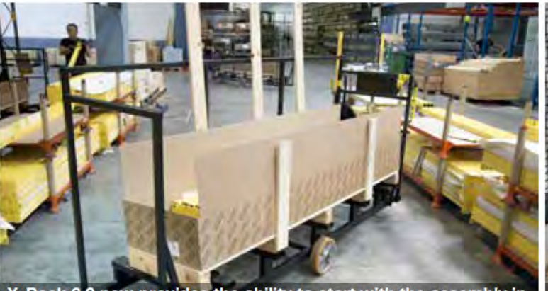
X-Pack 2.0 now provides the ability to start with the assembly in the order you want. Posts, small parts or mesh walls, everything is available immediately without the entire contents of the pallet is unpacked.