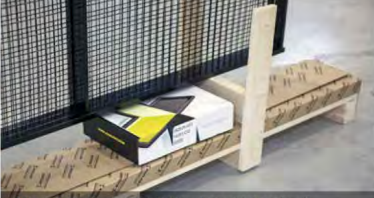
All small parts are collected in a box which makes it possible to quickly get started with the assembly and find the right details directly.